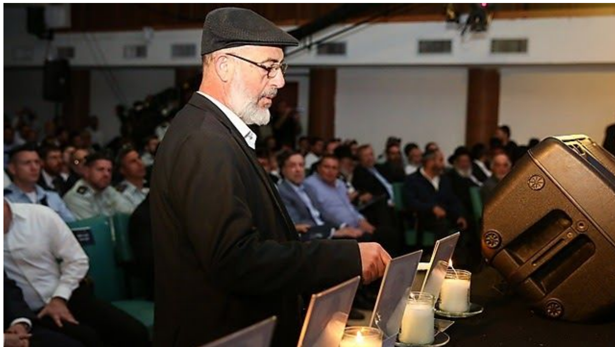
חיפשו נחמה