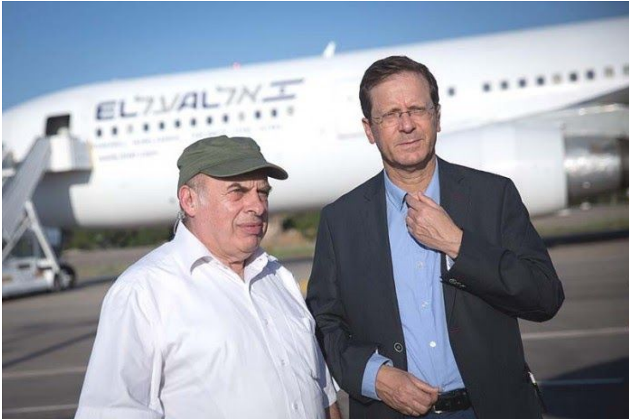
Outgoing and current heads of the Jewish Agency Natan Sharansky (L) and Isaac Herzog at Ben Gurion airport, July 23, 2018.